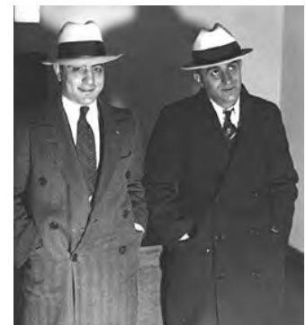
Italian Night at the Old Forge